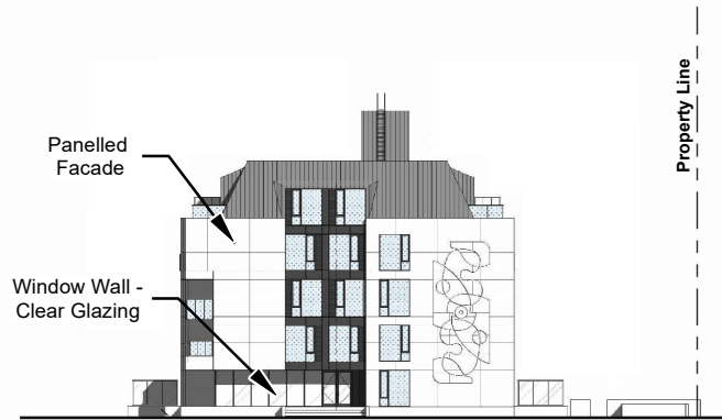
North Elevation (Facing Major Mackenzie Drive)