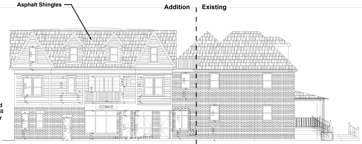
North Elevation - Facing Kellam Street