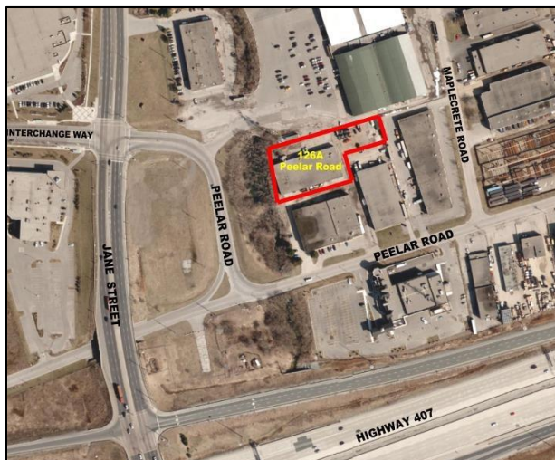
Figure 1- Subject Property Shown with Red Boundary

The subject property is situated on the east side of Jane Street and west of Maplecrete Road (See Figure 1). The total land area of the subject property is approximately 0.50 hectares (1.24 acres), and it is irregular in shape. The subject property currently does not have direct frontage on a municipal road but has access via Jane Street through Peelar Road, as well as through a private driveway access from the south of Peelar Road. The subject property is currently occupied by one industrial building and is bounded by industrial land uses to the north, east, and south. The Black Creek Channel is located to the west. The subject property will directly front onto the proposed east-west extension of Interchange Way. There is a significant grade difference between the subject property and the adjacent lands to the west.