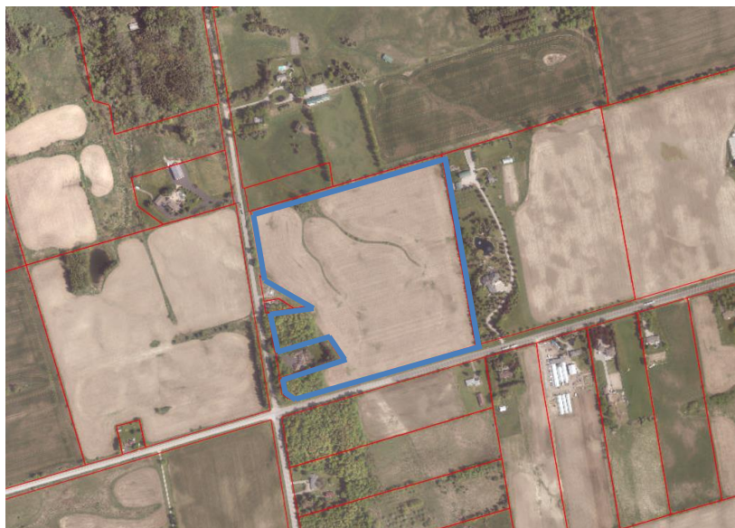
Figure 1. Aerial Image of Subject Site – YorkMaps: 2024 Imagery ( — Subject Site)

The Subject Site is located on the northeast quadrant of King-Vaughan Road and Pine Valley Drive. The lands are currently used for agricultural purposes. The area of the site is approximately 13.71 hectares (33.88 acres) with approximately 377.6 metres of frontage along King-Vaughan Road and 239.1 metres of frontage along Pine Valley Drive.