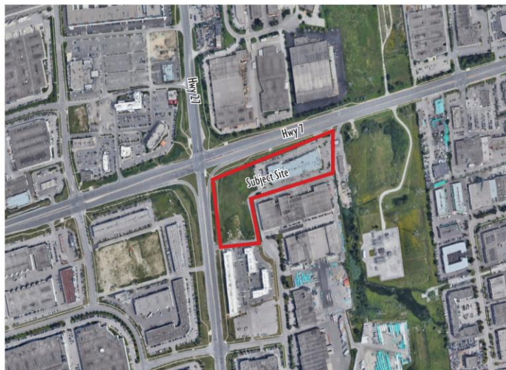
Figure 1. Aerial Image of Subject Lands

Innovative Planning Solutions Inc. ("IPS") is the planning consultant for Bostar Inc. and 1639326 Ontario Ltd., owners of the lands located at the southeast corner of Highway 7 and Highway 27 in the City of Vaughan (Refer to Figure 1). The Subject Lands are legally described as: PART BLOCK 1 PLAN 65M3033, PARTS 1, 2, 3, 4 & 5 PLAN 65R35836; and PART BLOCK 2 PLAN 65M3033 PARTS 73, 74, 75, 76 PLAN 65R26788.