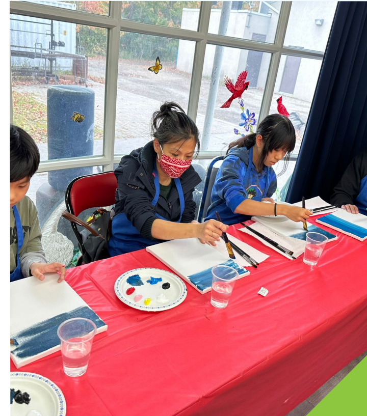
Paint night at Sara Elizabeth Centre