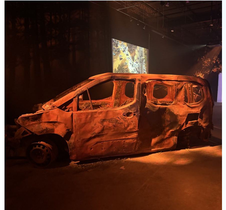
Burned car recovered from the Nova Music Festival site