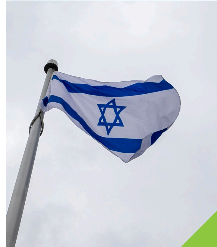
Flag-raised to mark Yom Ha'atzmaut