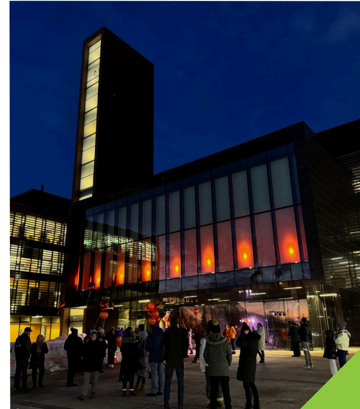
Illumination Vigil at Vaughan City Hall for the Bibas Family