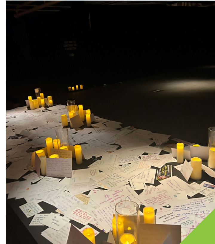
Memorial table for written tributes and reflections