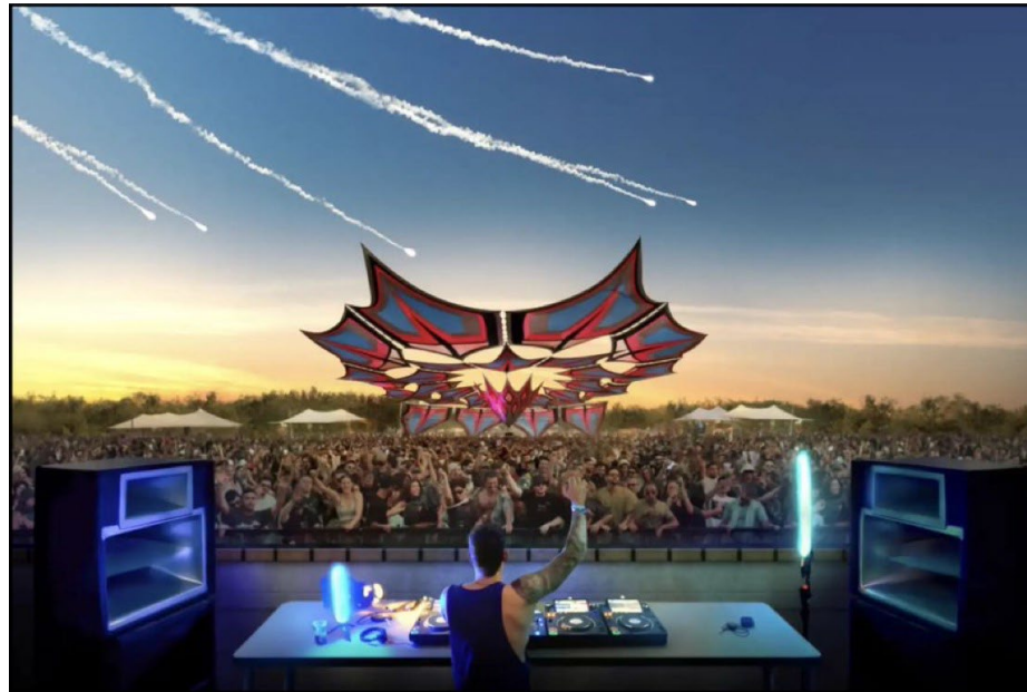
The Nova Music Festival – A celebration of peace, interrupted by violence