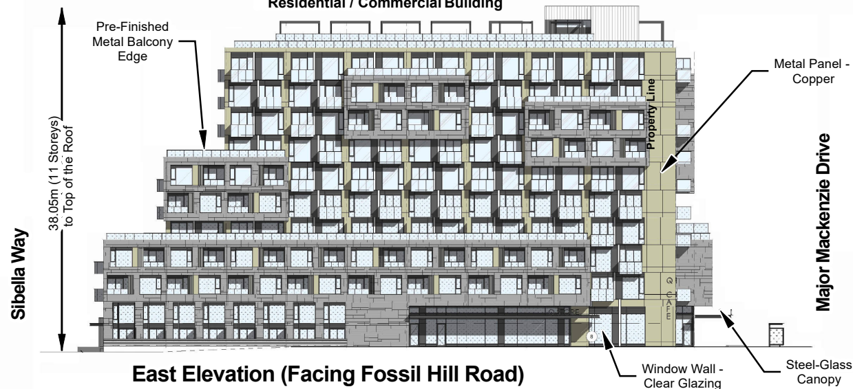
East Elevation (Facing Fossil Hill Road)