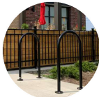
Bike Rack Maglin