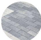
Unit Paving Unilock Umbriano