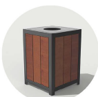
Waste Receptacle Maglin