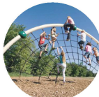
Play Area Landscape Structures