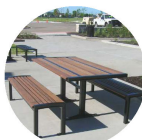
Picnic Table Maglin