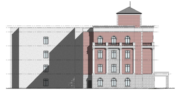
EAST ELEVATION (PHASE 1)