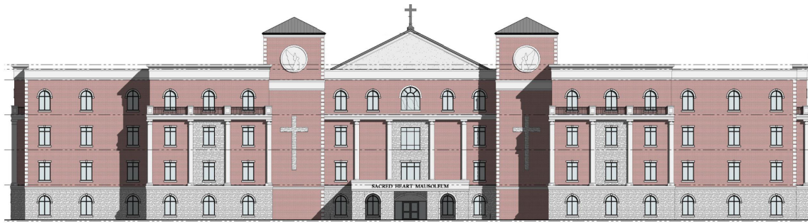
NORTH ELEVATION (PHASE 1)