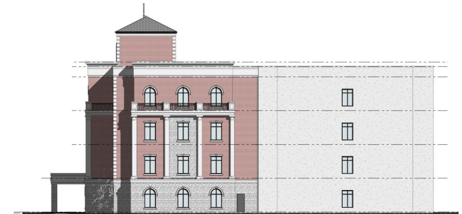
WEST ELEVATION (PHASE 1)