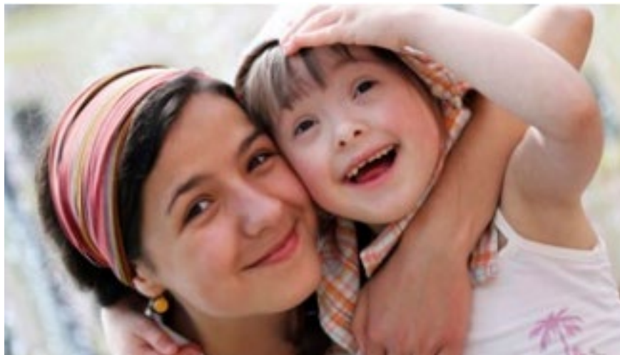
Woman and child smiling.