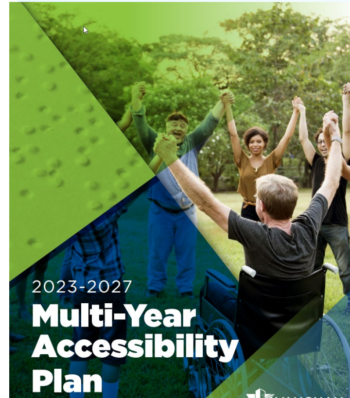
2023-2027 Multi-Year Accessibility Plan Cover Page