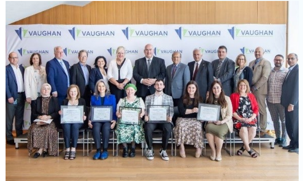
2024 Accessibility Champion Award winners with 2024 Committee Members, Mayor, Members of Council, and current and former City staff.