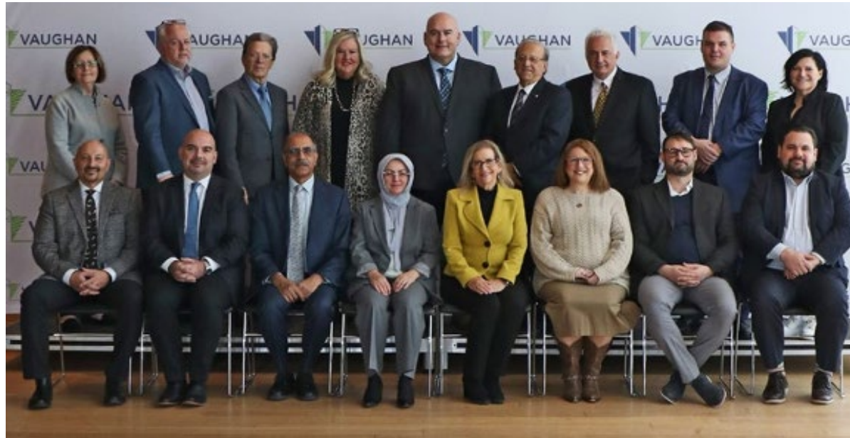
2024 Accessibility Committee Members with Mayor, Members of Council, current and former City staff.