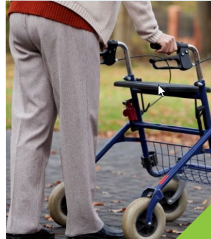
Person using a mobility walker.