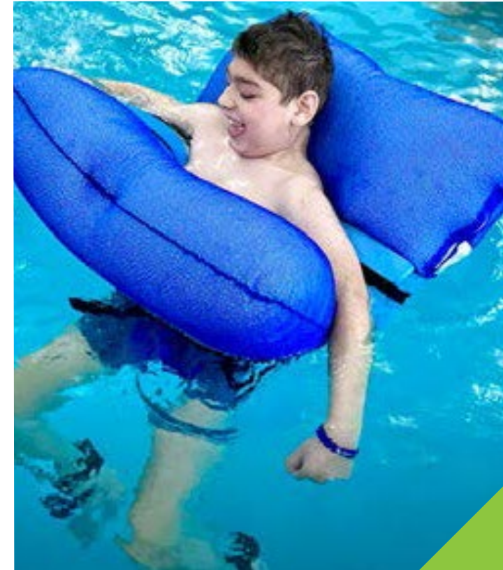
Young male using an assistive swimming device in a swimming pool.