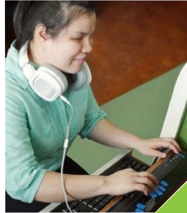
Woman using a computer with a braille display keyboard and headphones.