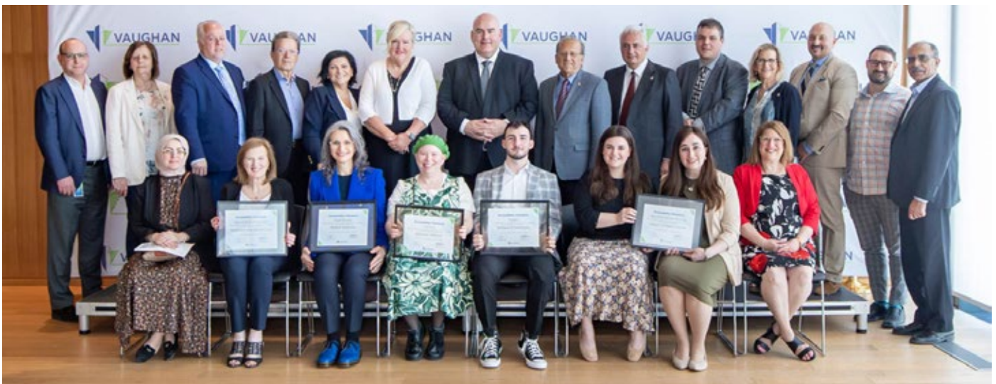
2024 Accessibility Champion Award winners with 2024 Committee Members, Mayor, Members of Council, current and former City staff.