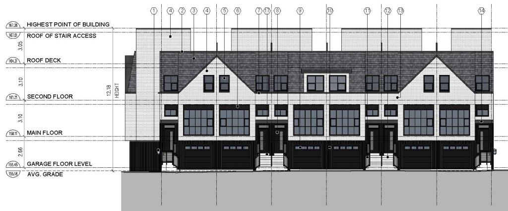
05 TYPE 2(WEST) FRONT ELEVATION A301 SCALE: 1:200