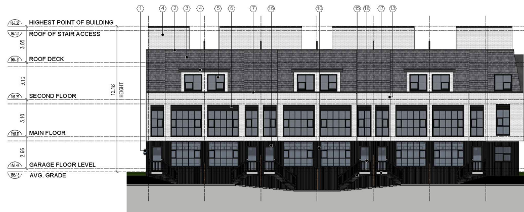
07 TYPE 2(EAST) REAR ELEVATION A301 SCALE: 1:200