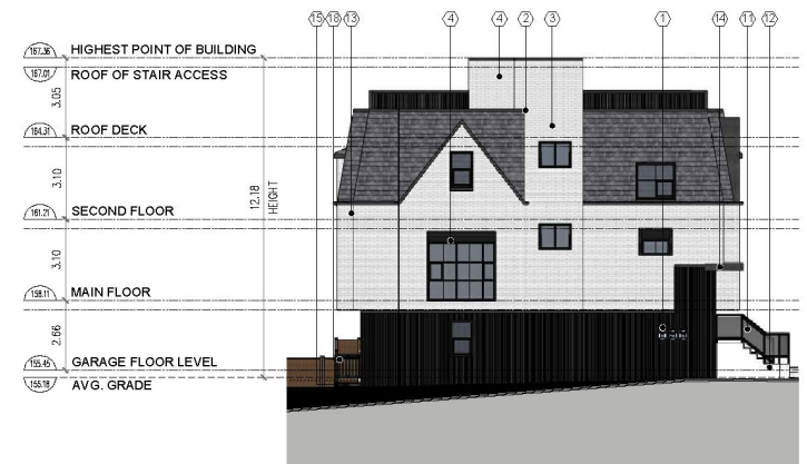
06 TYPE 2(NORTH) SIDE 1 ELEVATION A301 SCALE: 1:200