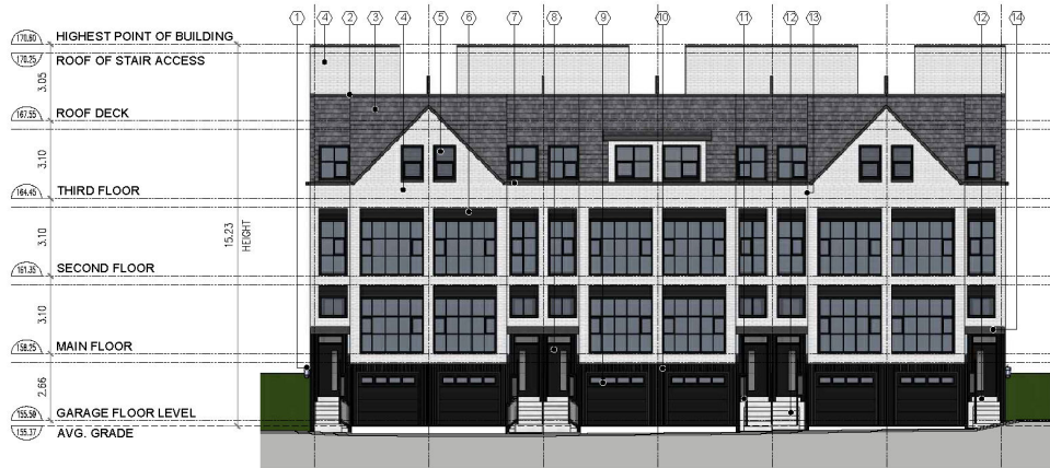
01 TYPE 1 (BLOCKS 4 TO 7) FRONT ELEVATION A301 SCALE: 1:200