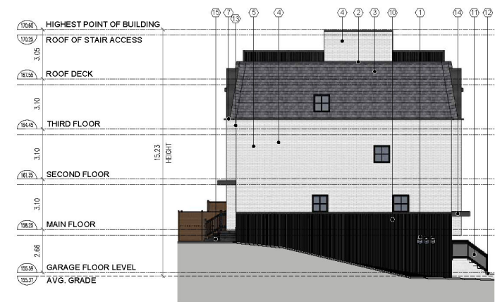
02 TYPE 1 (BLOCKS 4 TO 7) SIDE 1 ELEVATION A301 SCALE: 1:200