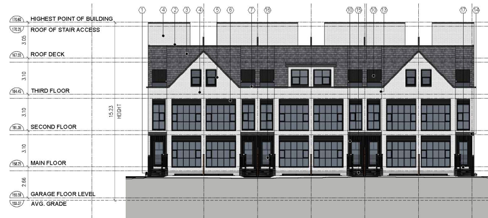
03 TYPE 1 (BLOCKS 4 TO 7) REAR ELEVATION A301 SCALE: 1:200