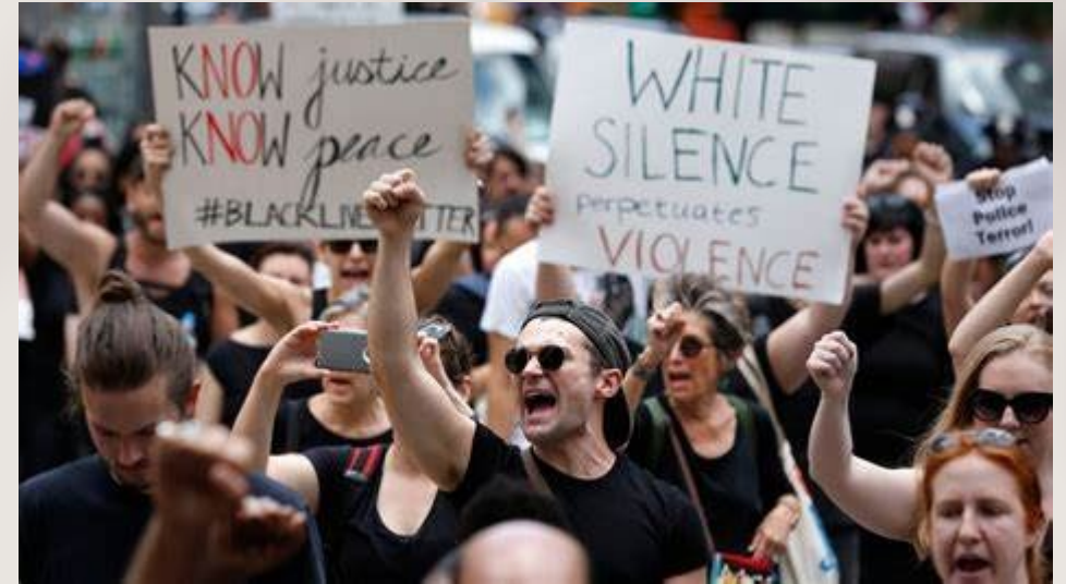
Politically Fueled division and Hate