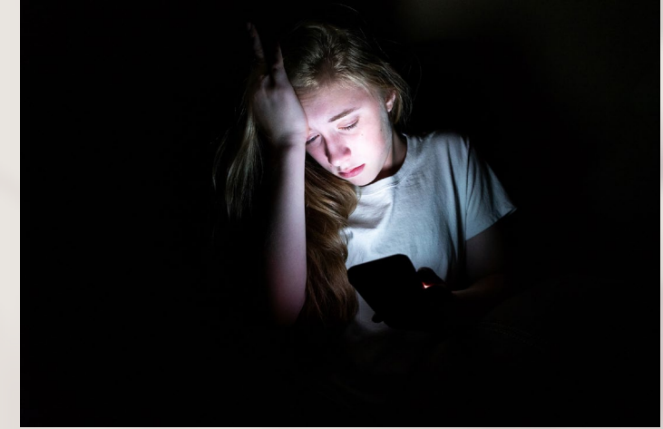
Growing anxiety and depression