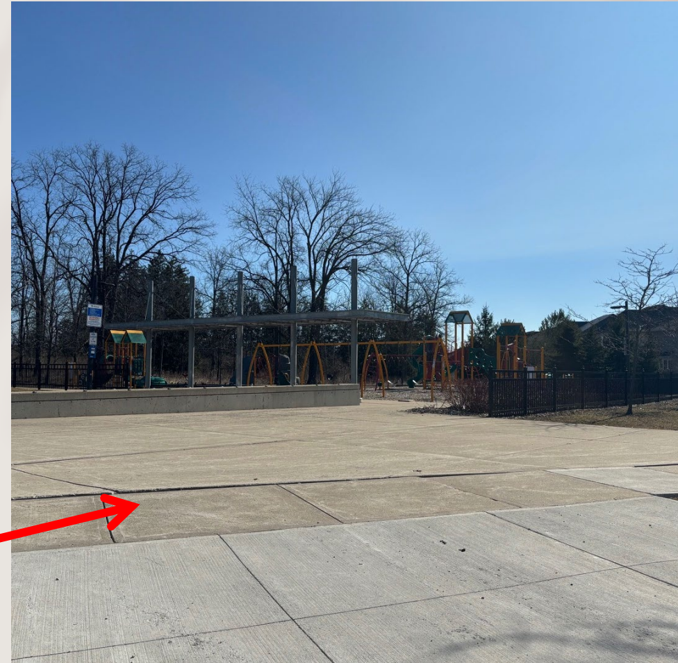
Image: My local park - Forest View Park near Teston Road, west of Bathurst Street