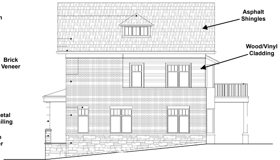
North Elevation - Facing Private Laneway