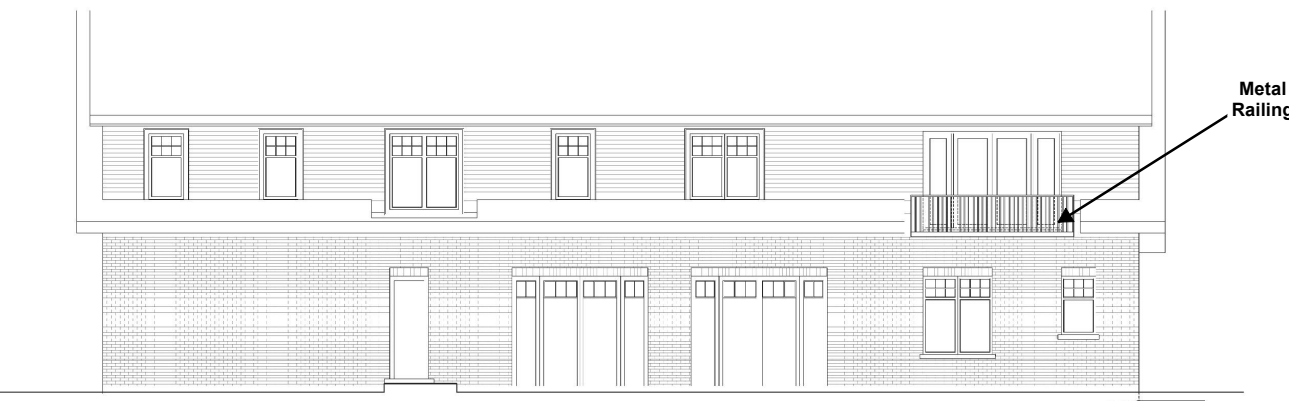
North (Rear) Elevation