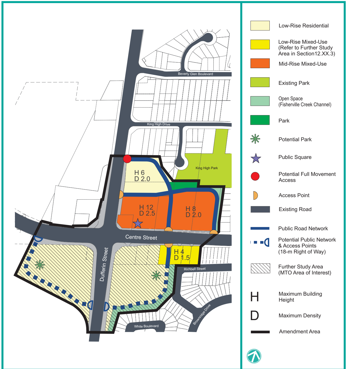
Map 12. XX.A: Dufferin Street and Centre Street Intersection, Land-Use, Density, Building Heights and Street Network Plan