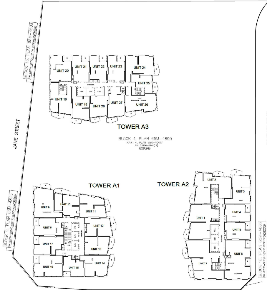
TOWER A3 BLOCK 4, PLAN 65M-4805 PART 4, PLAN 65M-40417 RV 02776-0981(L1) ©©©©