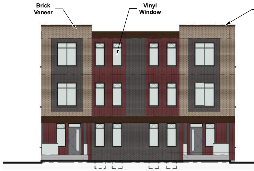
North (Front) Elevation - Facing Dalhousie Street