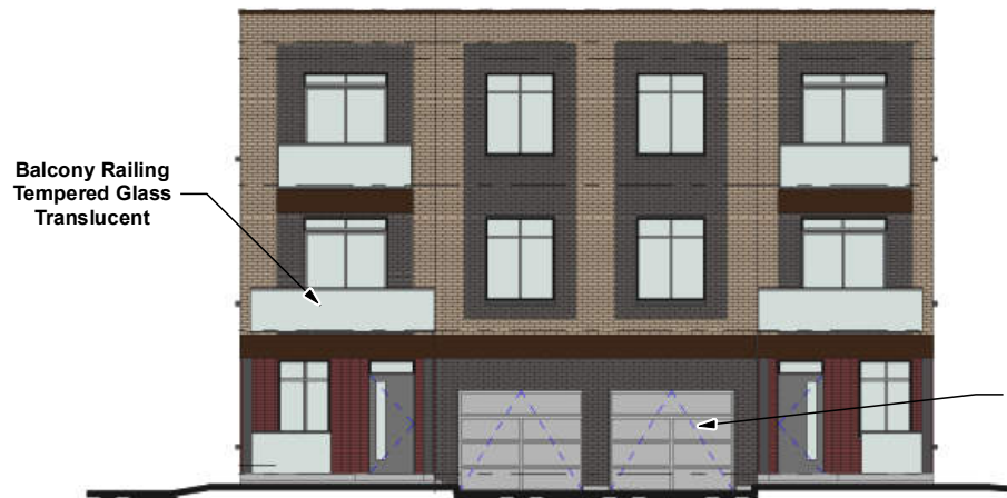
South (Rear) Elevation - Facing Saintfield Drive