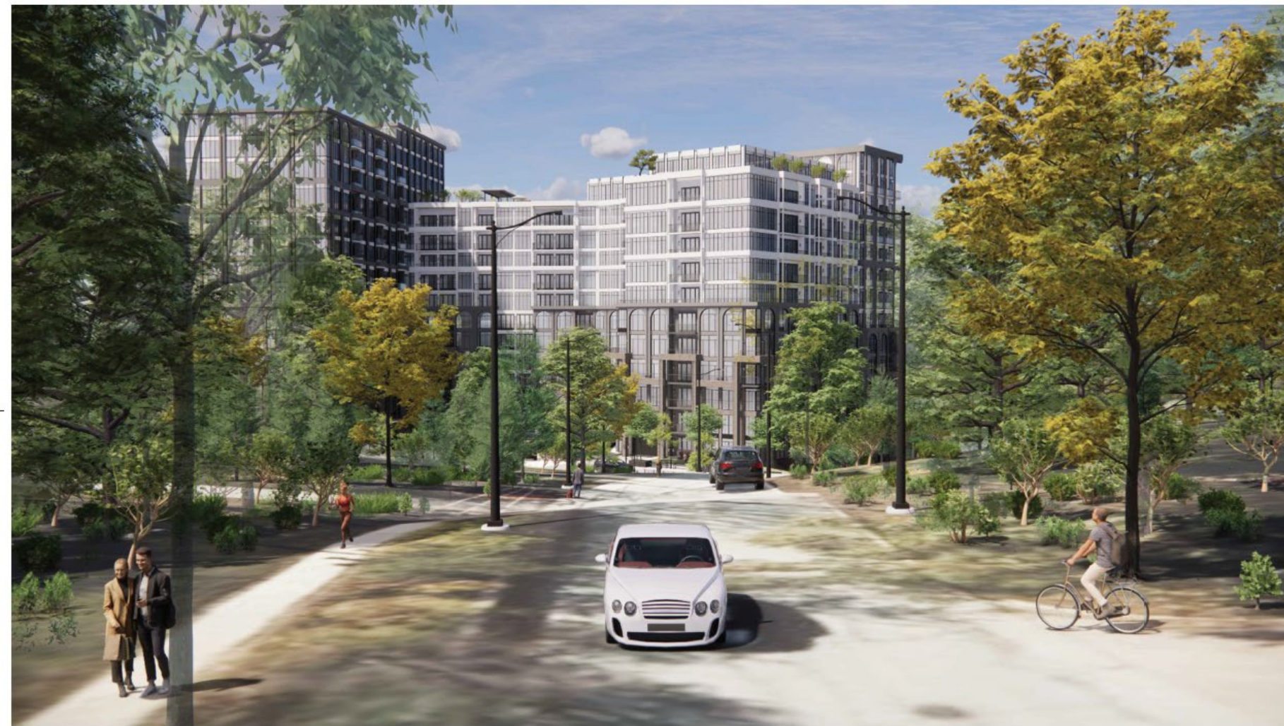
VIEW FROM NASHVILLE