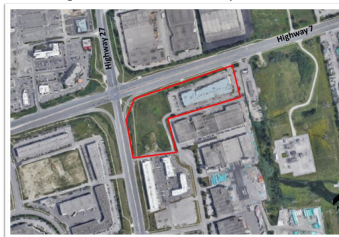
Figure 1 – Aerial View of Subject Lands

Figure 1 of this letter provides an aerial overlay on the Subject Lands. The western portion of the subject lands are vacant, and the eastern portion are occupied by a commercial building. The Subject Lands are in a pre-submission application stage.