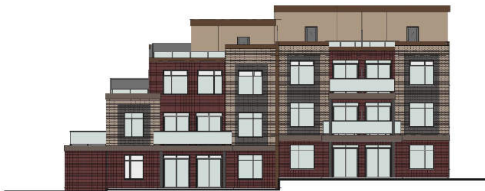
West (Rear) Elevation - Facing Existing Driveway