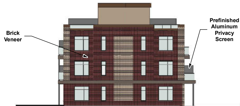
South Elevation - Facing Steeles Avenue West