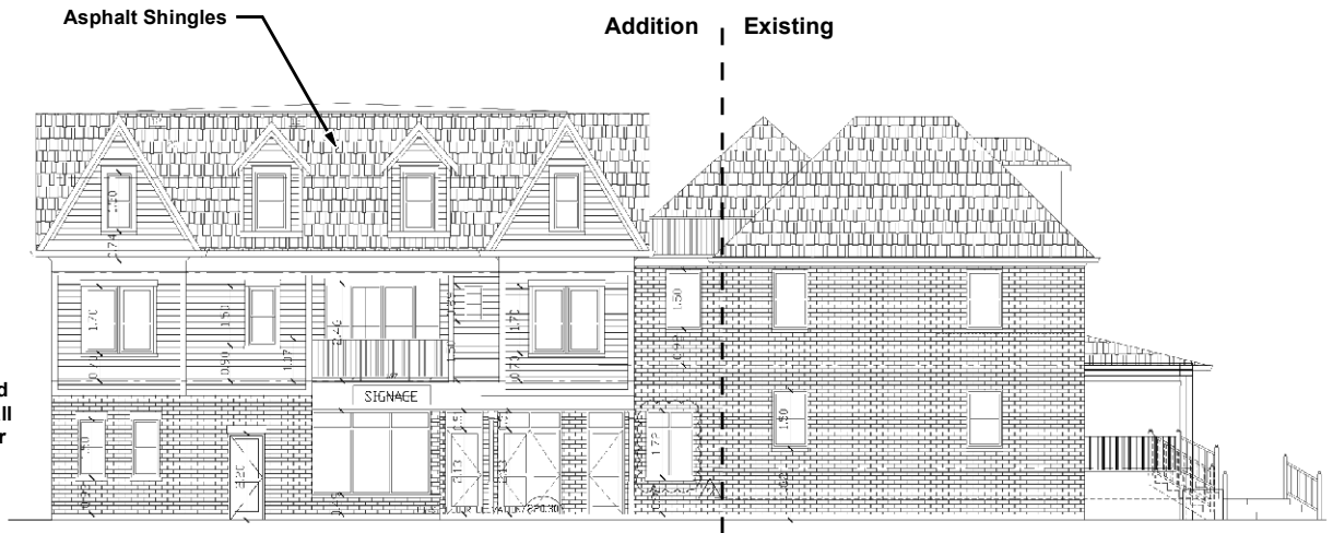
North Elevation - Facing Kellam Street