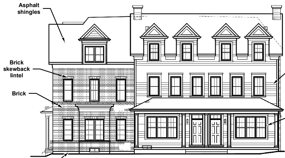
East (Front) Elevation - Facing Islington Avenue