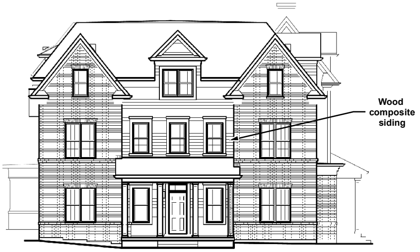
South (Left Side) Elevation - Facing Future Private Road