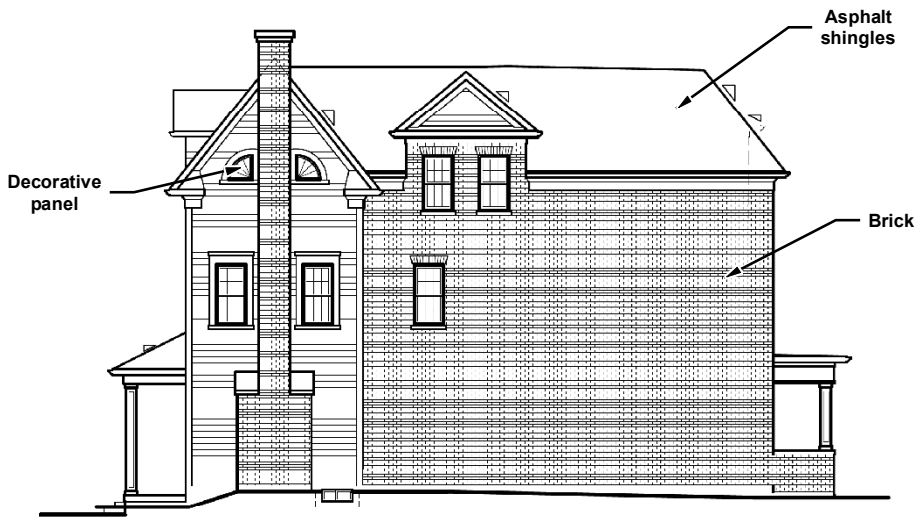
North (Right Side) Elevation