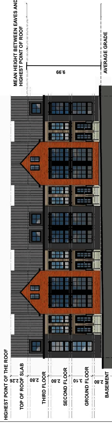
EAST ELEVATION (FACING STREET 'B')