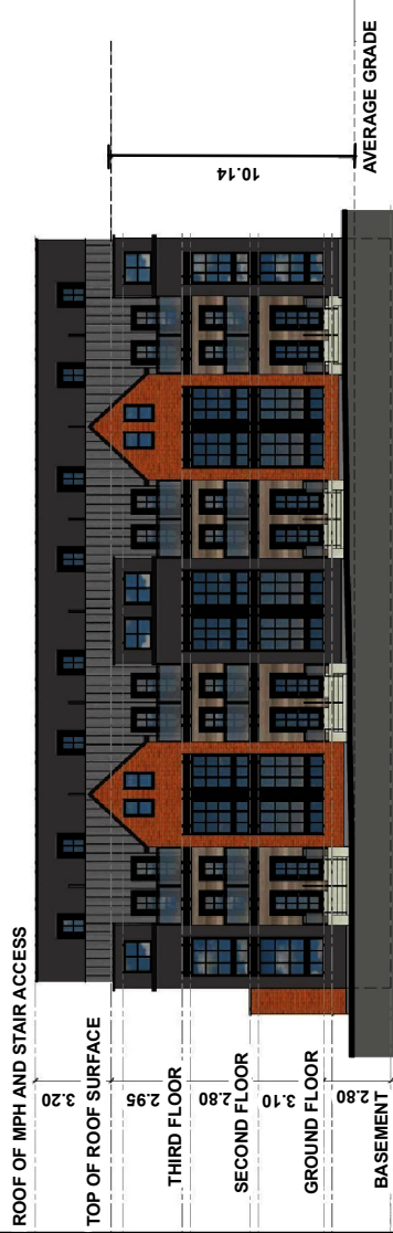
NORTH ELEVATION (FACING STREET 'A')