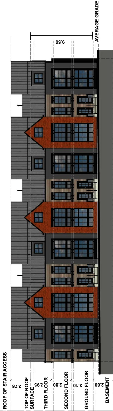
EAST ELEVATION (FACING ATKINSON AVENUE)