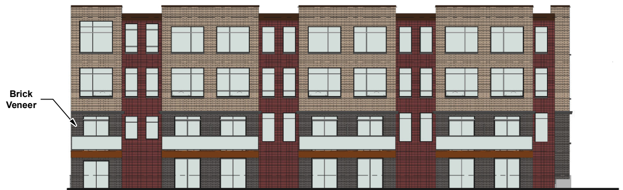
North (Rear) Elevation