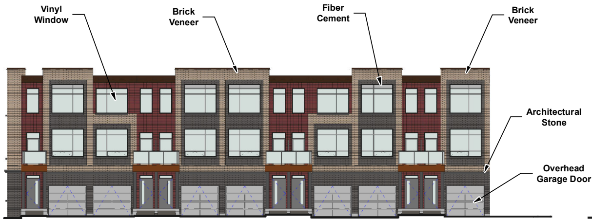
South (Front) Elevation - Facing Dalhousie Street