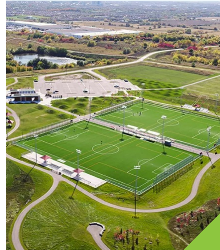
North Maple Regional Park