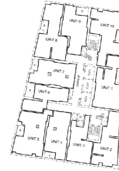
PLAN VIEW ILLUSTRATING UNITS 1 TO 10 INCLUSIVE (Residential) LEVELS 35 TO 42 INCLUSIVE