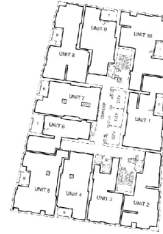
PLAN VIEW ILLUSTRATING UNITS 1 TO 10 INCLUSIVE (Residential) LEVEL 34