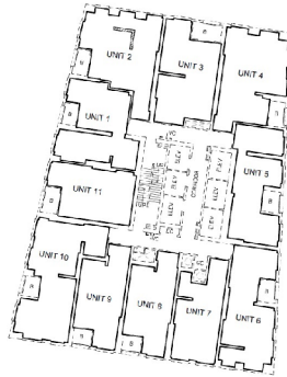
PLAN VIEW ILLUSTRATING UNITS 1 TO 11 INCLUSIVE (Residential) LEVELS 22 TO 28 INCLUSIVE