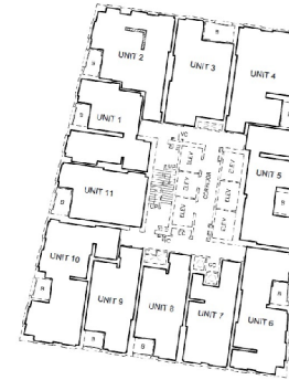
PLAN VIEW ILLUSTRATING UNITS 1 TO 11 INCLUSIVE (Residential) LEVELS 29 AND 30