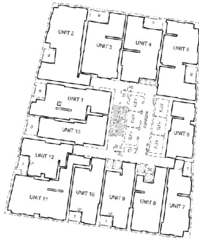
PLAN VIEW ILLUSTRATING UNITS 1 TO 13 INCLUSIVE (Residential) LEVEL 5