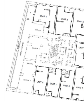
PLAN VIEW ILLUSTRATING UNITS 1 TO 13 INCLUSIVE (Residential) LEVEL 20