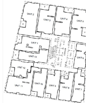
PLAN VIEW ILLUSTRATING UNITS 1 TO 13 INCLUSIVE (Residential) LEVEL 19