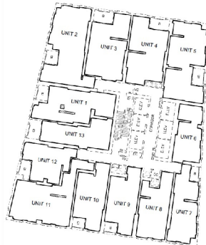
PLAN VIEW ILLUSTRATING UNITS 1 TO 13 INCLUSIVE (Residential) LEVELS 6 TO 18 INCLUSIVE