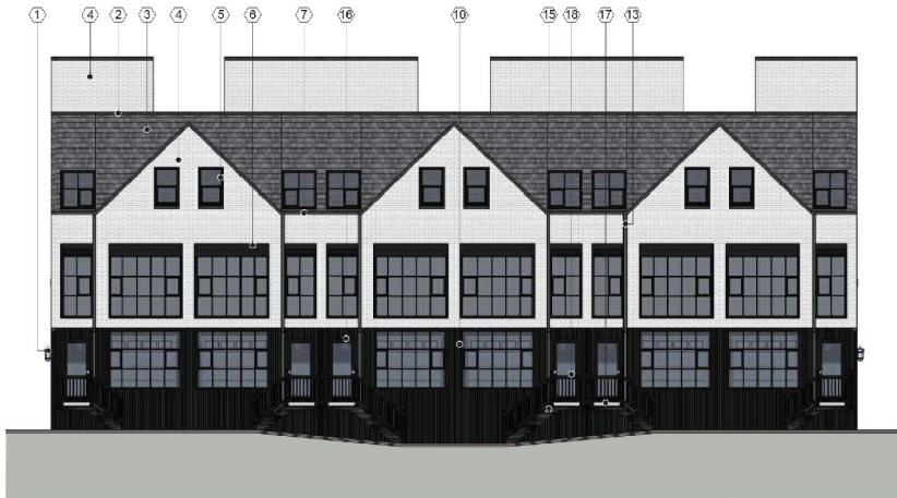
Type 2 (Block 8) Rear Elevation