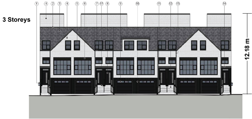
Type 2 (Block 8) Front Elevation