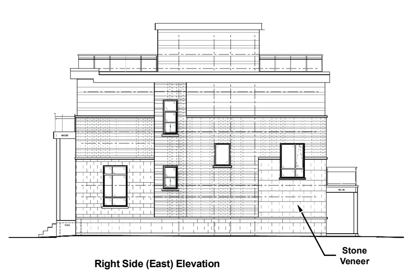
Right Side (East) Elevation