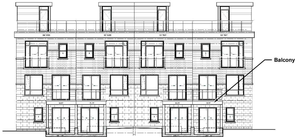
Rear (North) Elevation