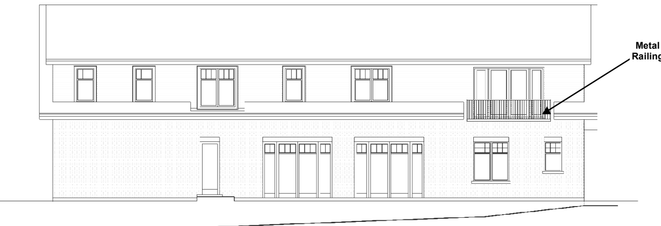
North (Rear) Elevation