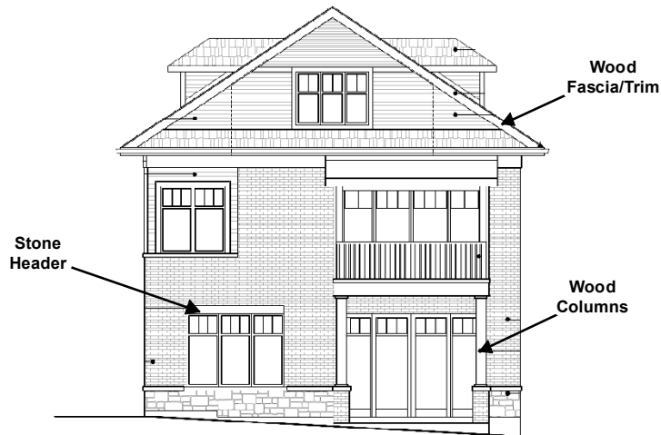
West (Rear) Elevation