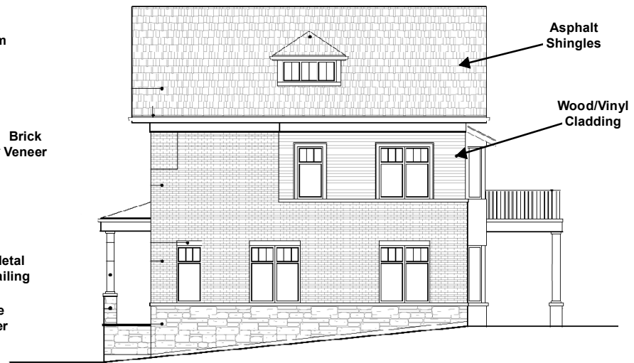
North Elevation - Facing Private Laneway