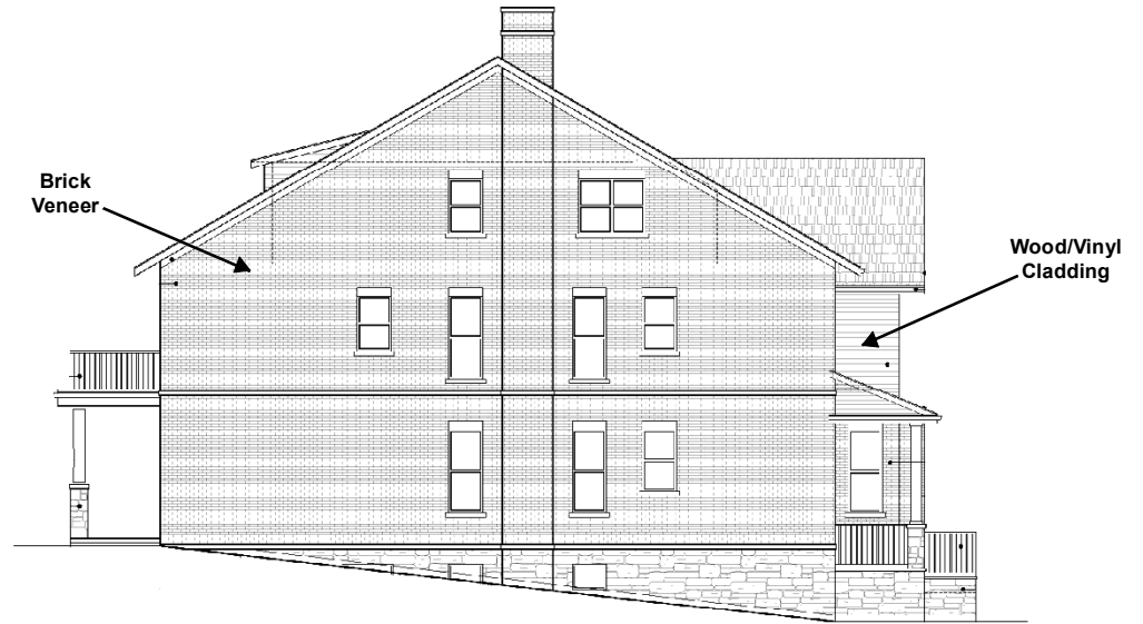
South Elevation - Facing Private Laneway