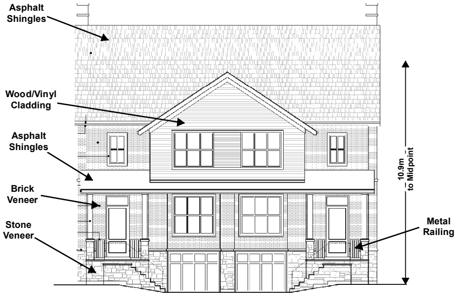
East (Front) Elevation - Facing Wallace Street