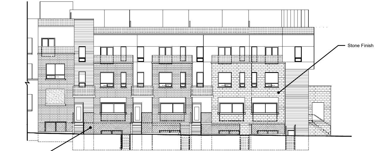
South Elevation - Facing Hartman Avenue