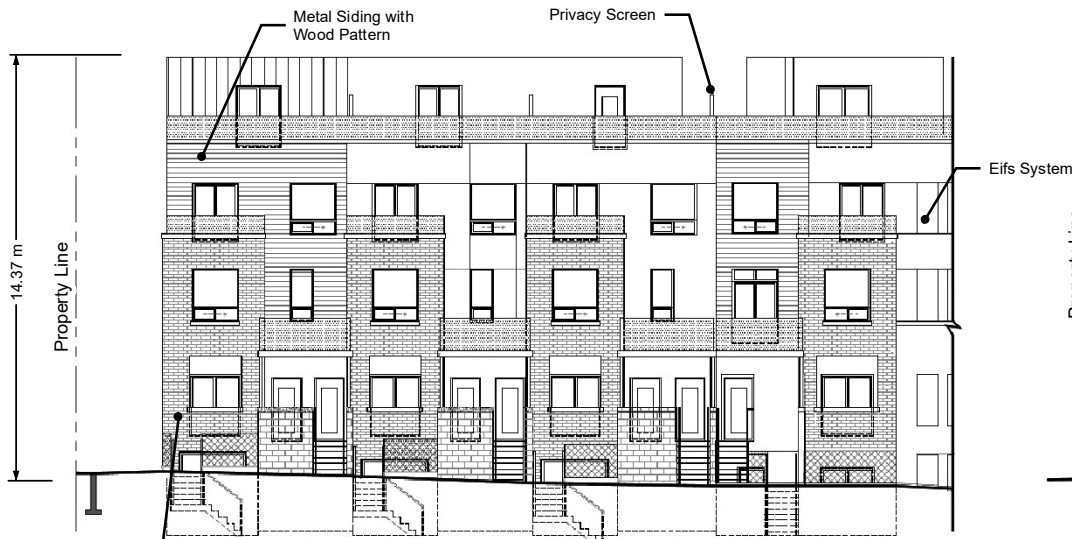
West Elevation - Facing Islington Avenue