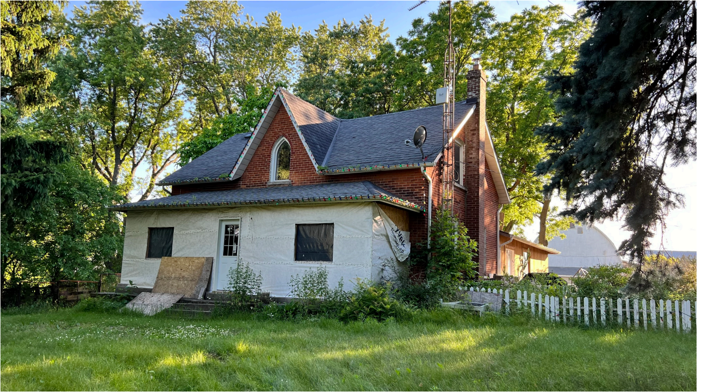
11420 Huntington Road, west elevation, 2024