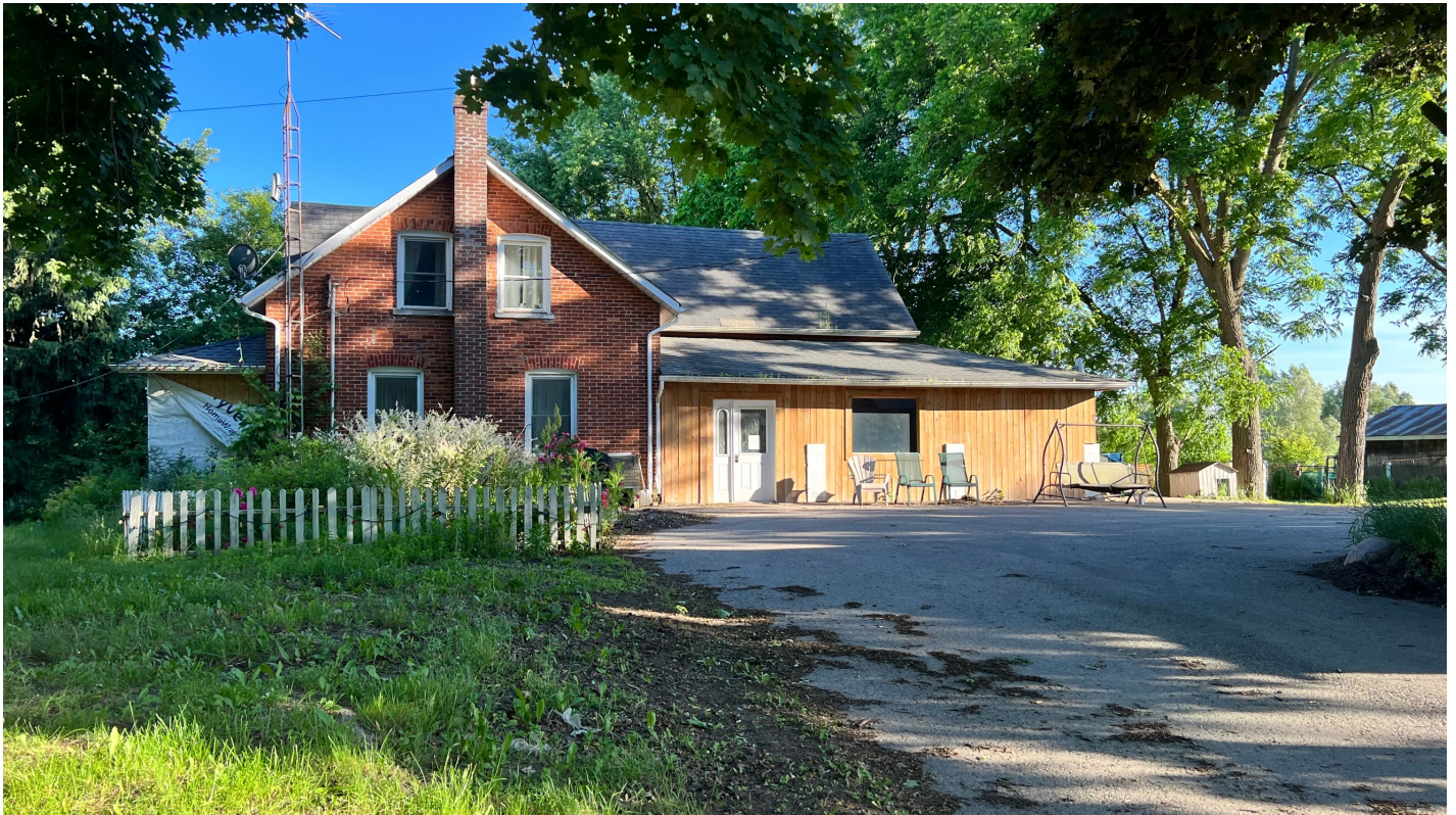
11420 Huntington Road, north elevation, 2024