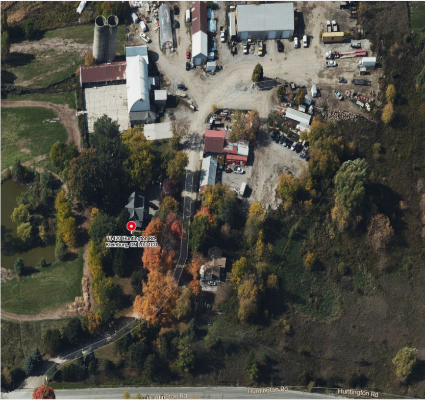
View of the subject site from Google Earth (May 2024)