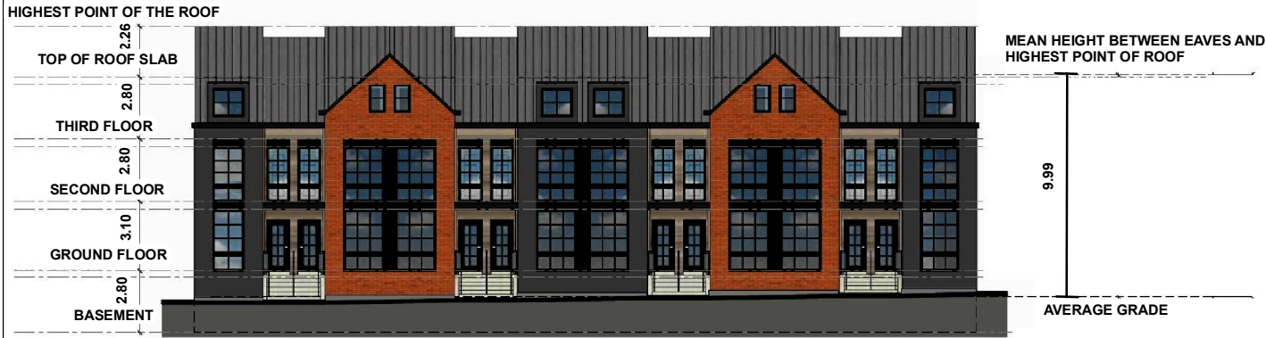
EAST ELEVATION (FACING STREET 'B')