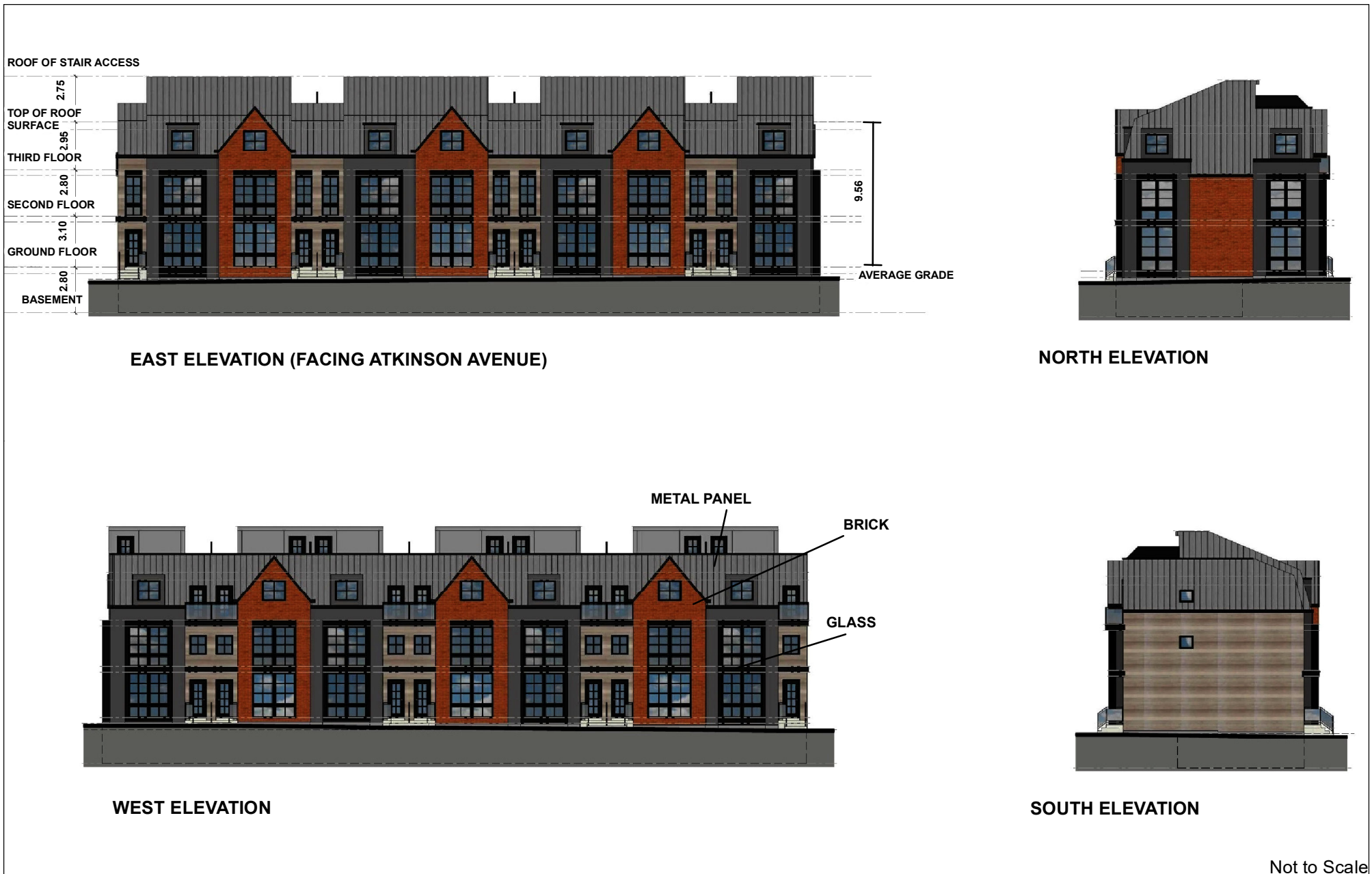
EAST ELEVATION (FACING ATKINSON AVENUE)