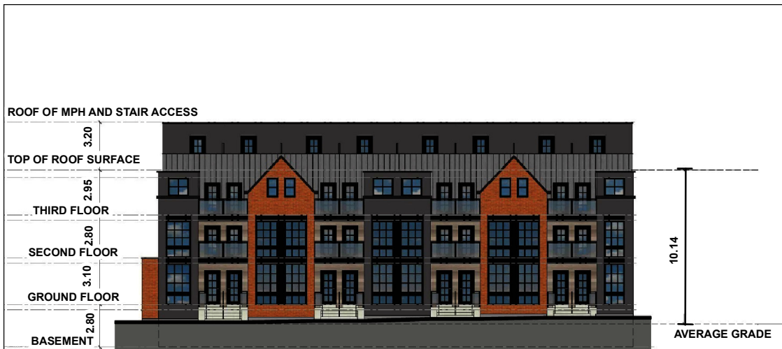
NORTH ELEVATION (FACING STREET 'A')