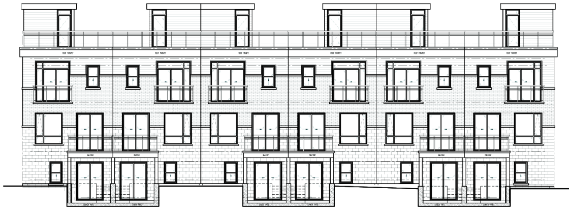
Rear (North) Elevation