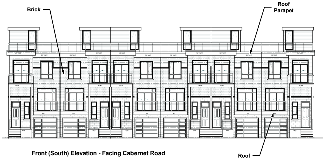
Front (South) Elevation - Facing Cabernet Road