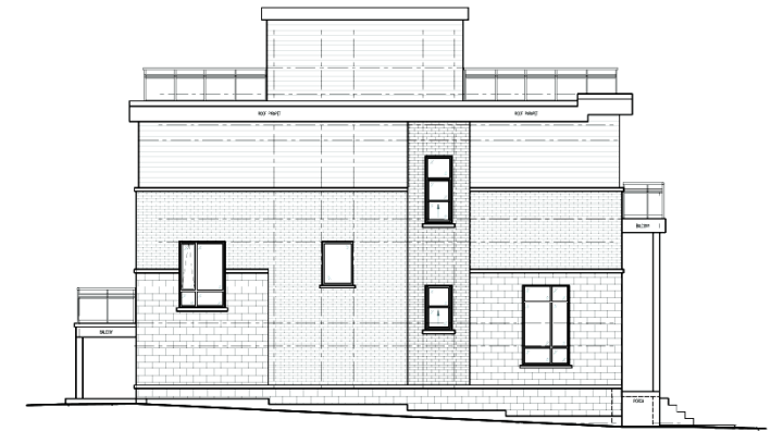
Left Side (West) Elevation