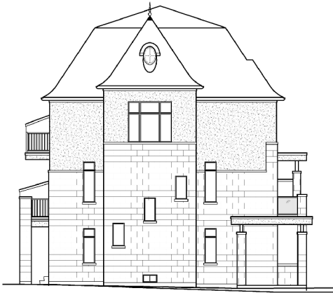
West Elevation - Facing Islington Avenue