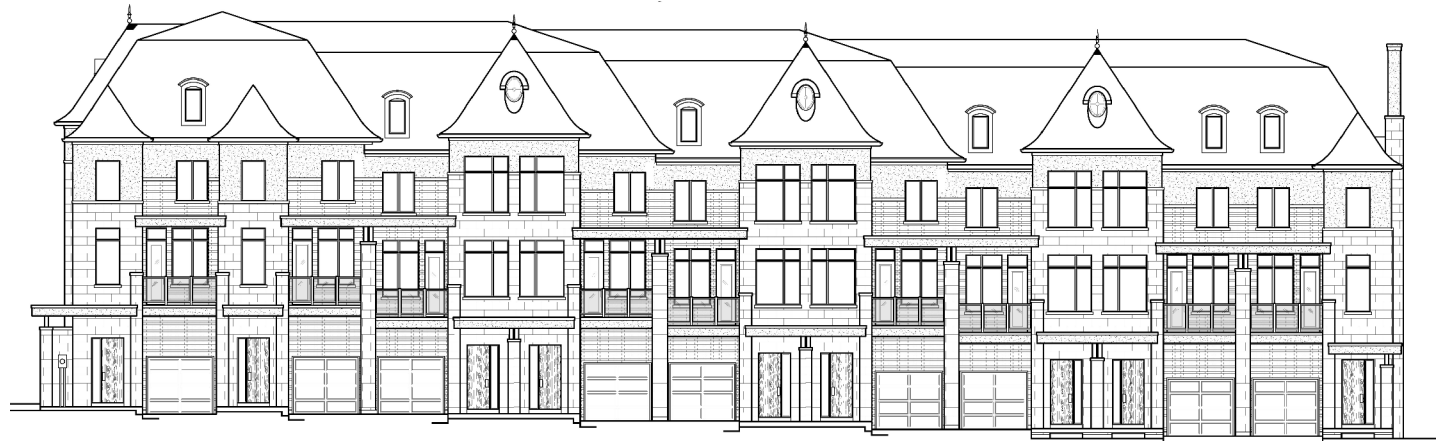
South Elevation - Facing Street 'A'