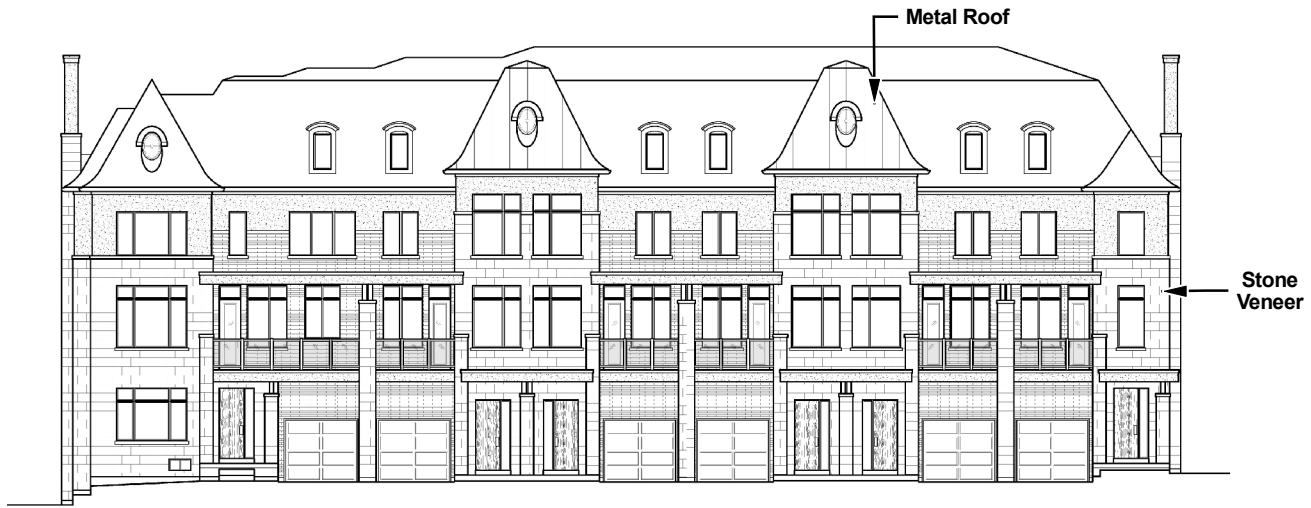
West Elevation - Facing Street 'B'