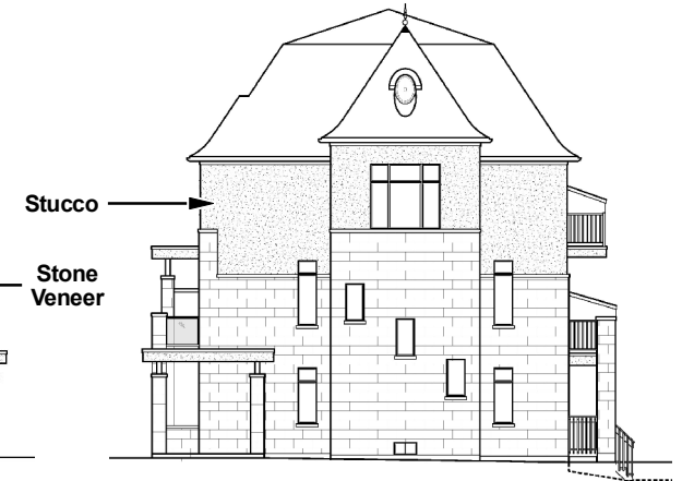
West Elevation - Facing Islington Avenue