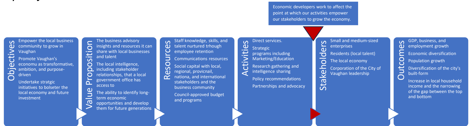
Figure 1: Economic Development Logic Model / Theory of Change

Through EcDev, the city empowers businesses expanding in Vaughan, residents, and stakeholders to advance economic prosperity and job creation: EcDev sets the stage for prosperity.