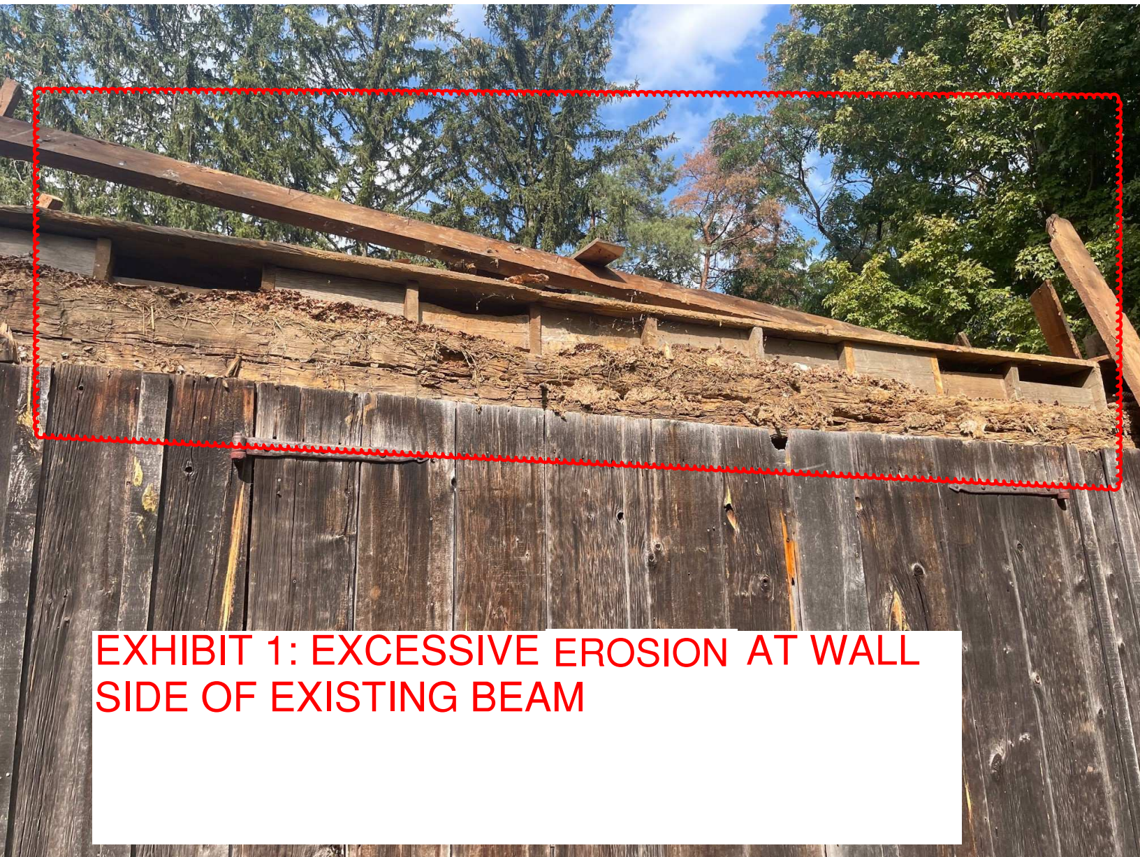
EXHIBIT 1: EXCESSIVE EROSION AT WALL SIDE OF EXISTING BEAM