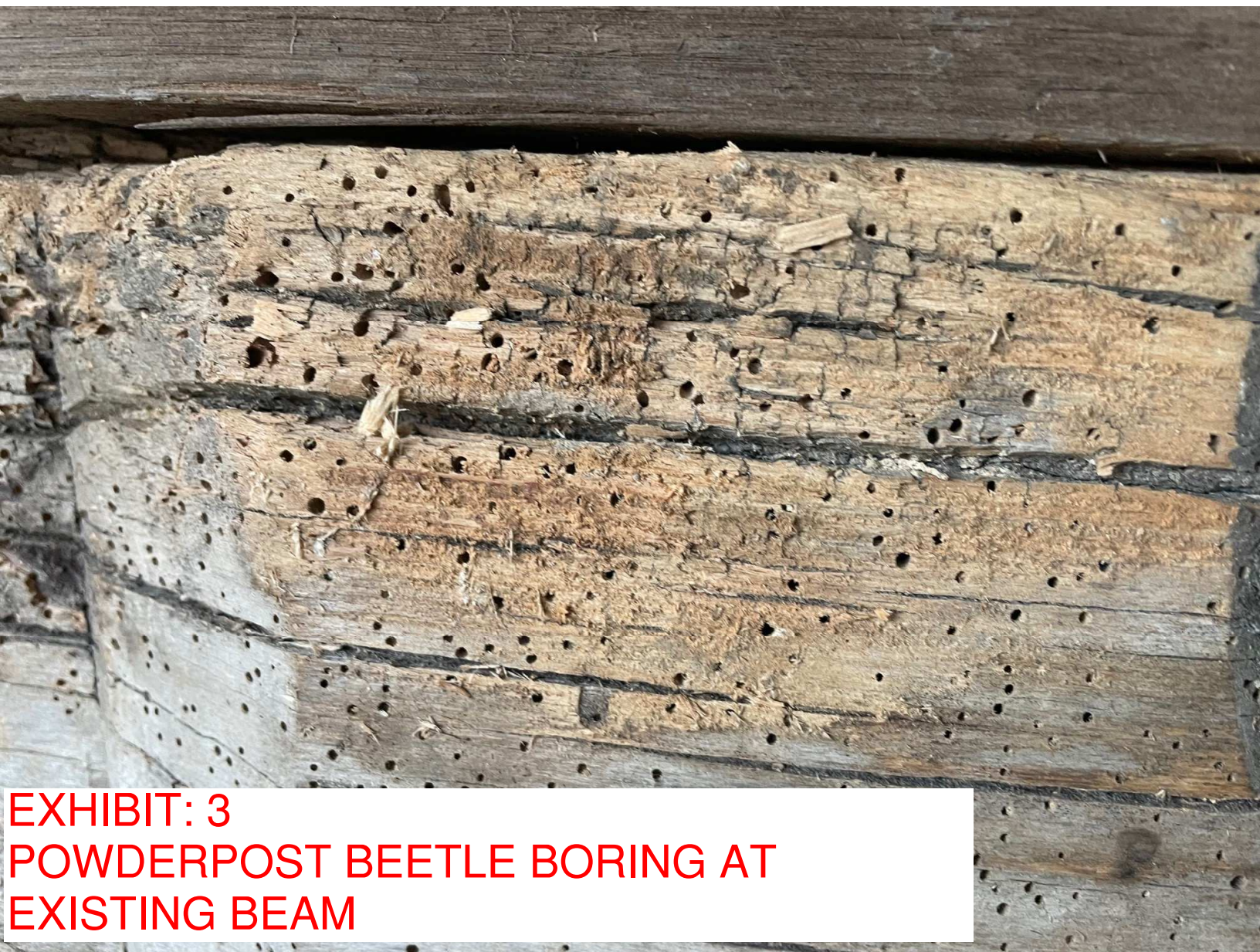
EXHIBIT: 3 POWDERPOST BEETLE BORING AT EXISTING BEAM