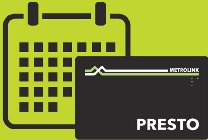
Fare Capping Program