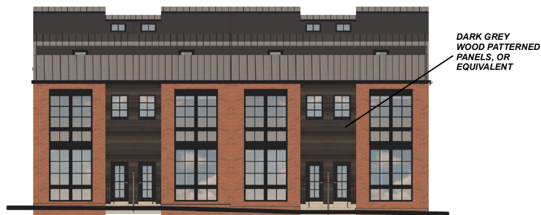
BLOCK 5 SOUTH (REAR) ELEVATION