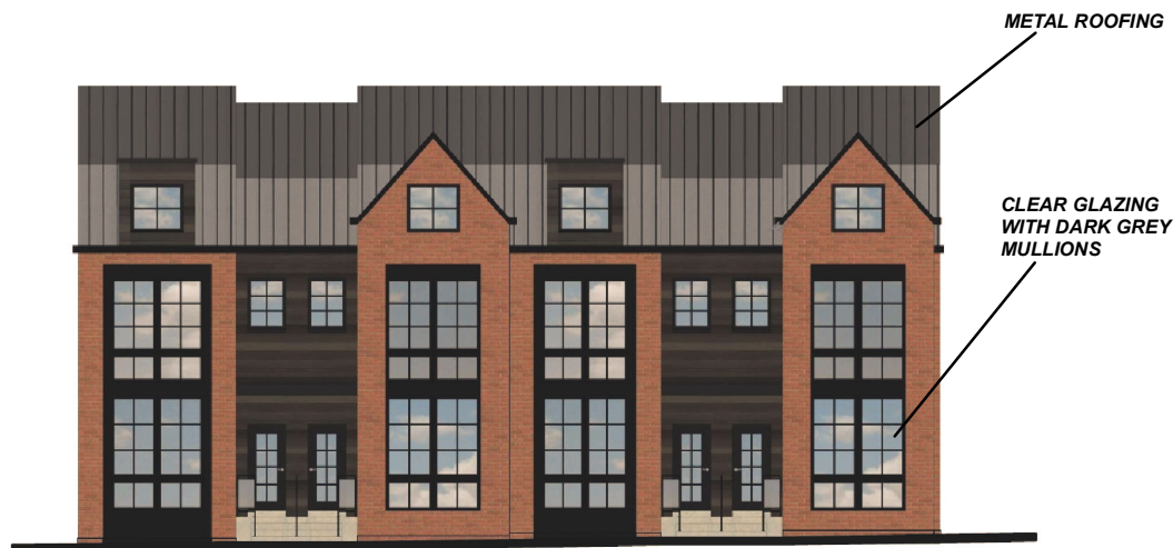
BLOCK 5 NORTH ELEVATION - FACING STREET C