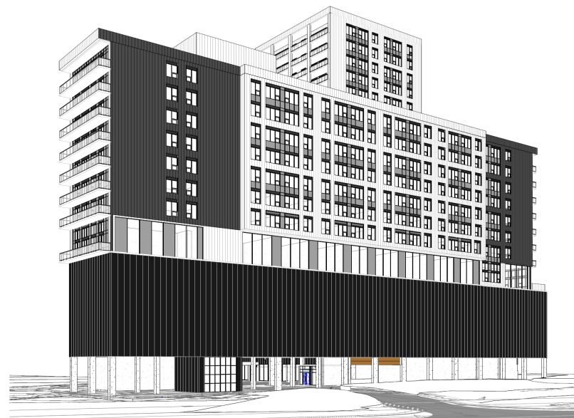
VIEW FROM SOUTHEAST