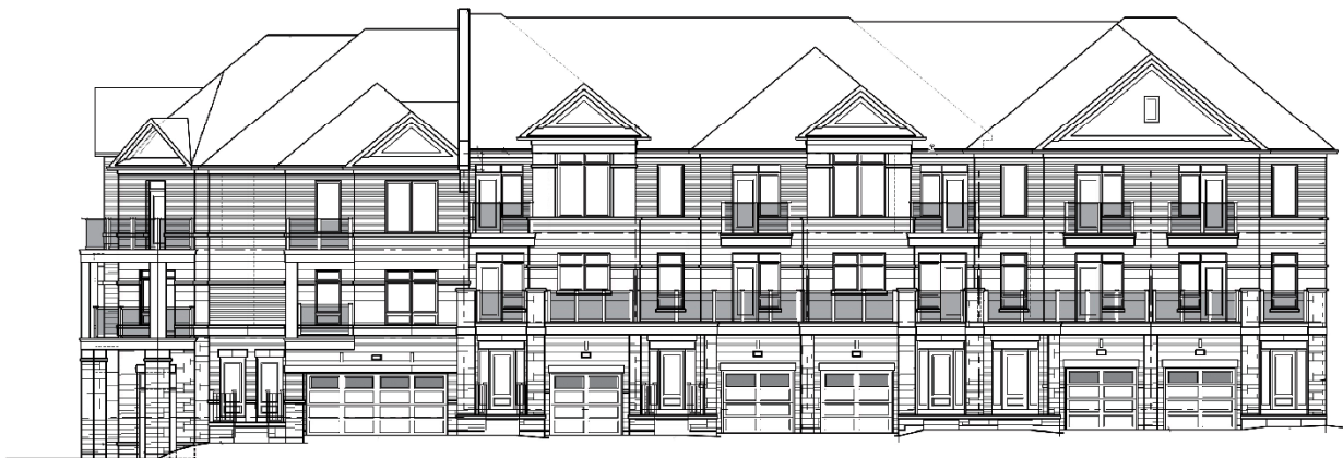
Rear Elevation - Facing Barons Street