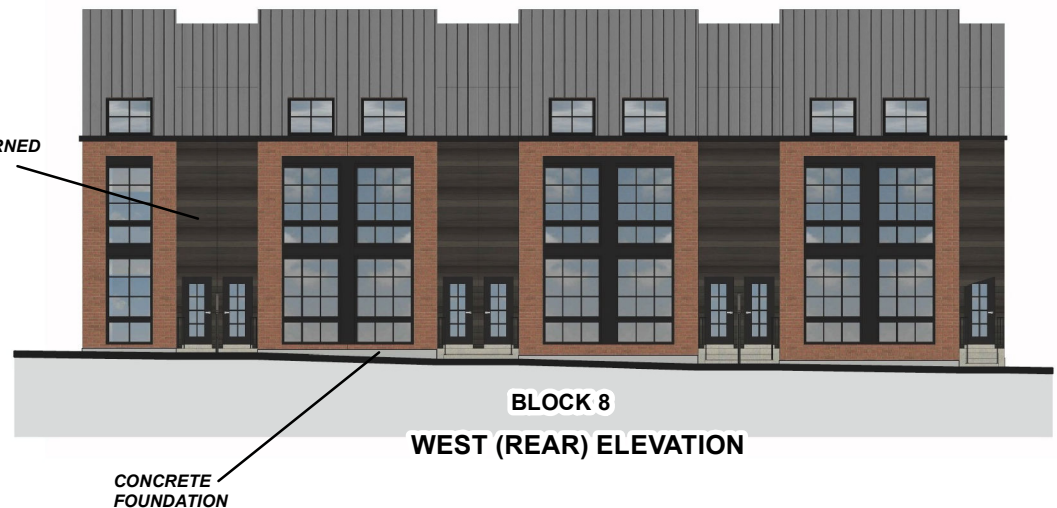
BLOCK 8 WEST (REAR) ELEVATION