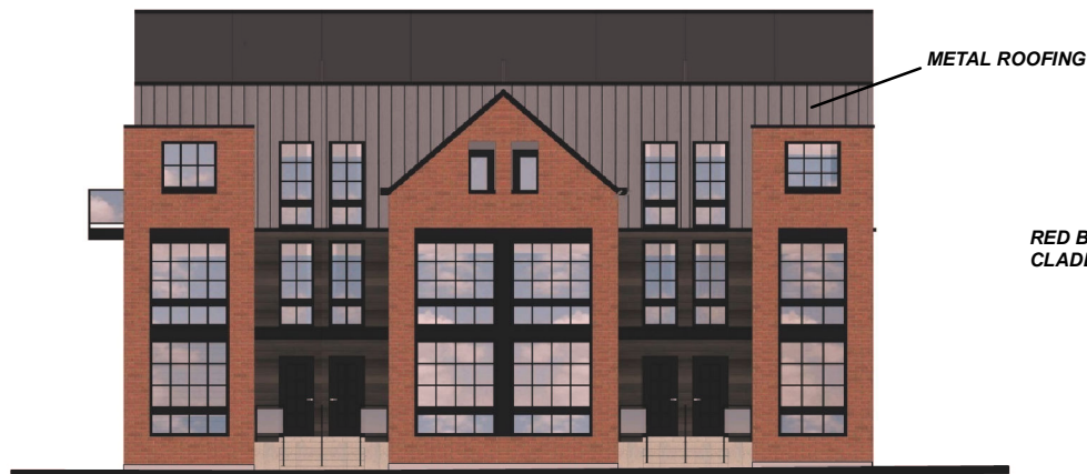
BLOCK 12 EAST ELEVATION - FACING STREET D