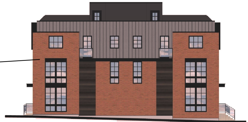
BLOCK 12 SOUTH ELEVATION - FACING STREET C