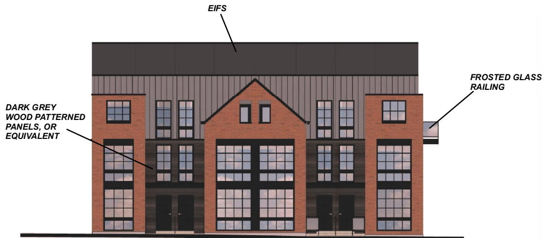
BLOCK 12 WEST ELEVATION