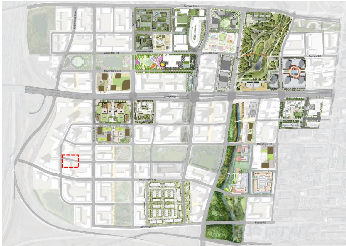
Figure 1-Site Location within a conceptual rendering of the VMC developments under review

The Assembly Park site sits west of 80 Interchange Way in the VMC. This temporary, transitional site intends to create an engaging public space with garden beds, plantings and Public Art installed in an Outdoor Gallery for the community to “assemble, gather and connect” for eight to ten years prior to being transformed into future developments.